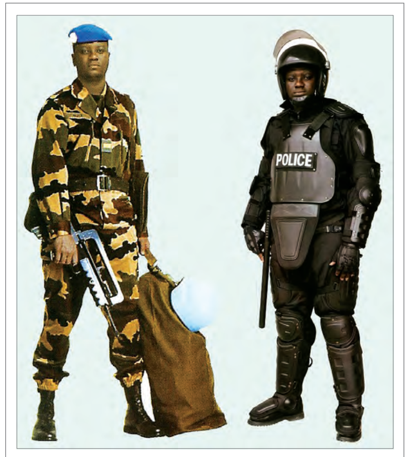
Illustrations in Chinese Arms Catalogs of Ethnic Africans wearing Chinese Military (left) and Police Equipment (right) ("Military Supplies" and "Police Supplies" from Poly Technologies, Inc. 2010)

Chinese exporters are offering a wide range of weapons and ancillary military equipment. Chinese exhibitors at ADD 2010 and IDEX 2011 distributed brochures featuring (1) small arms, (2) armored vehicles (such as the WMZ551 armored fighting vehicle and VN1 family of 8\times8 armored vehicles),