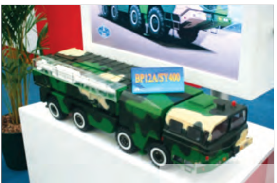
Models of the B611M and BP12A/SY400 Short-Range Tactical Ballistic Missiles on Display at ADD 2010

NORINCO and Poly Technologies are also targeting the African police and paramilitary internal security force markets. Products being displayed and advertised included riot protective gear for individuals, non-lethal weapons and launchers, riot batons, personal restraining devices, and internal security vehicles.