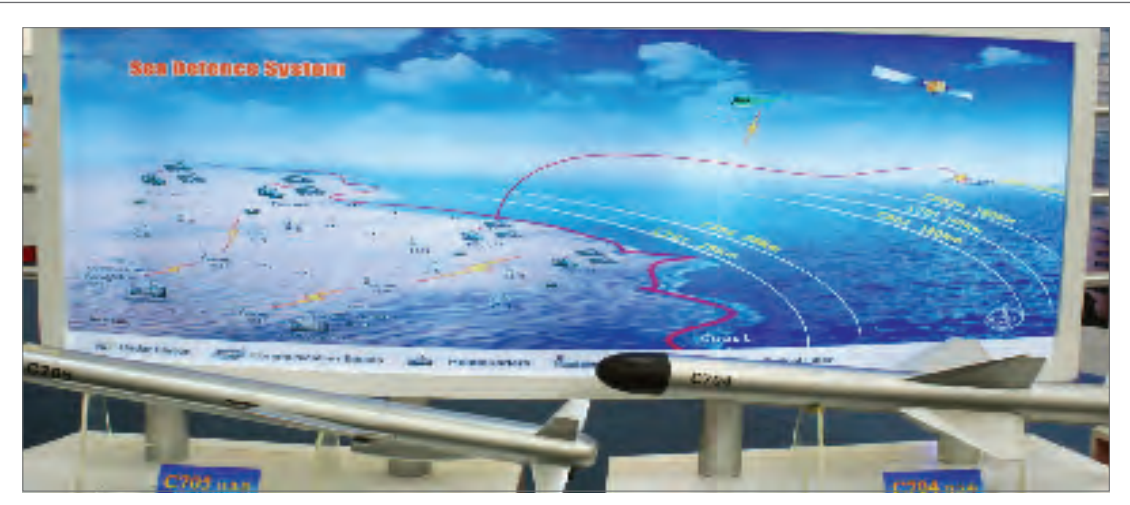
Models of C-705 and C-704 Anti-Ship Cruise Missiles on Display at ADD 2010

equipment. NORINCO's marketing emphasis at ADD 2010, for example, included the (1) Red Arrow-8 anti-tank guided missile (ATGM), (2) MBT-2000 main battle tank, (3) VN2A wheeled armored personnel carrier, and (4) LD2000 air defense system. At the same show, CPMIEC emphasized equipment such as A-100 long-range artillery rockets, several kinds of anti-ship cruise missiles, and the HQ-9/FD-2000/FT-2000 surface-to-air missile system.