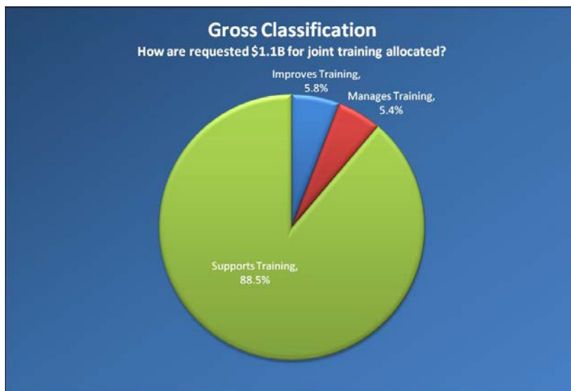
Figure 2: Initial Categorization of T2 Funding Proposals

Figure 2 presents an evaluation of last year’s funding requests. It indicates that almost 90 percent of them focused on supporting training, which included some capital expenditures. Only six percent were designed to improve training tools and techniques.