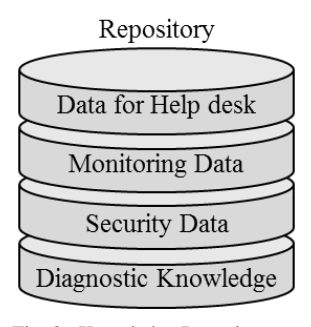
Fig. 3. Knowledge Repository

source of all information on the operation of the cloud. Instrumented agents feed the data base on a schedule or on demand. The knowledge base is where all information related to the enterprise SOA is stored. This will include the following: